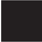
BLACK RAL 9017